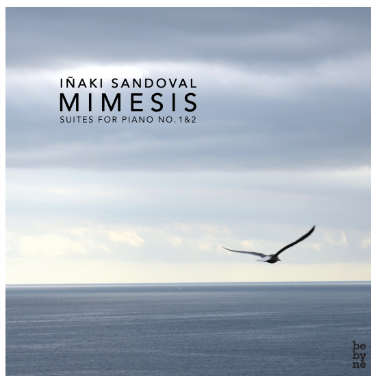
MIMESIS (2018), ref. CDB021