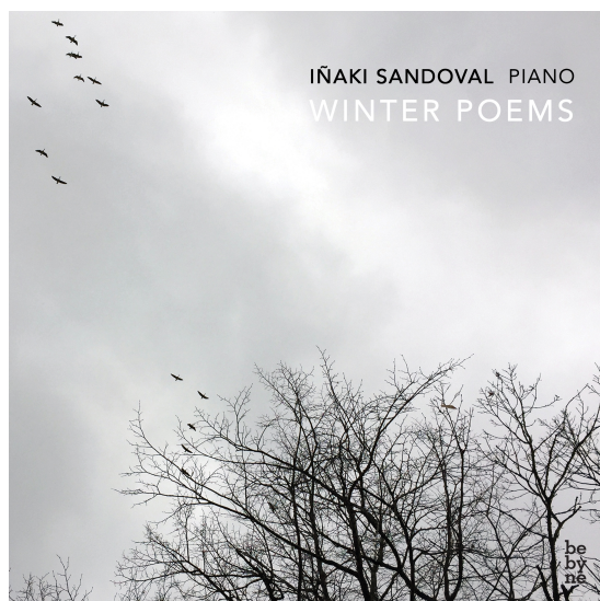
WINTER POEMS (2017), ref. CDB020